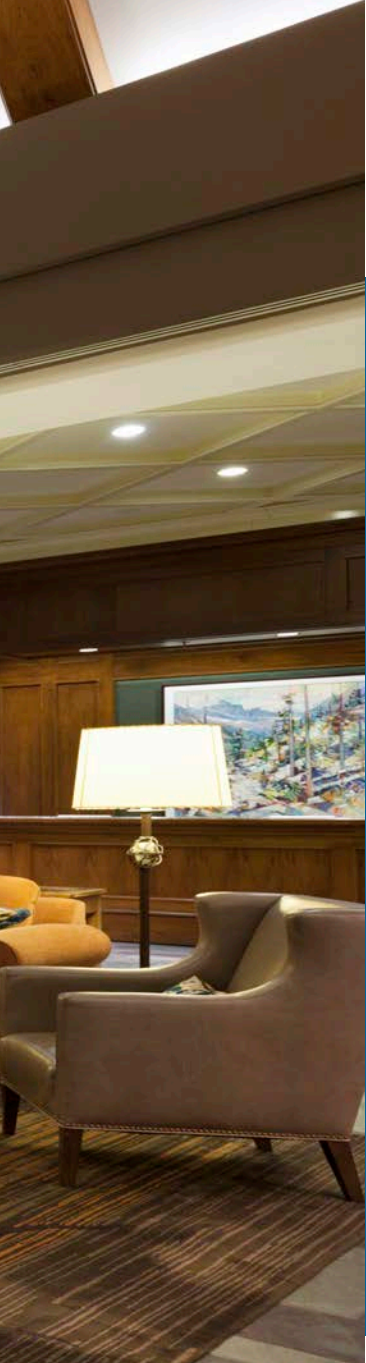
Fairmont Chateau Whistler