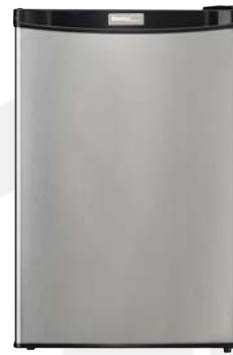
4.4 CU. FT.