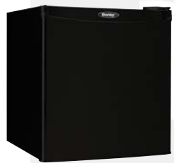
1.6 CU. FT.

Mini-Fridge and Microwave appliances for hospitality.