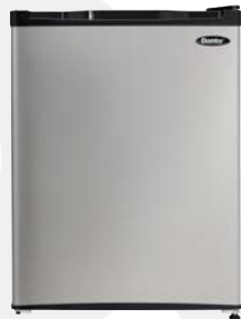
2.3 CU. FT.