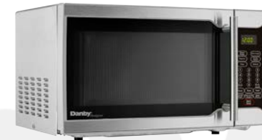
DANBY DESIGNER 0.7 CU. FT.