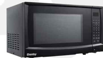
DANBY 0.7 CU. FT.