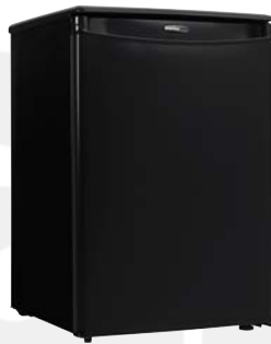
3.2 CU. FT.