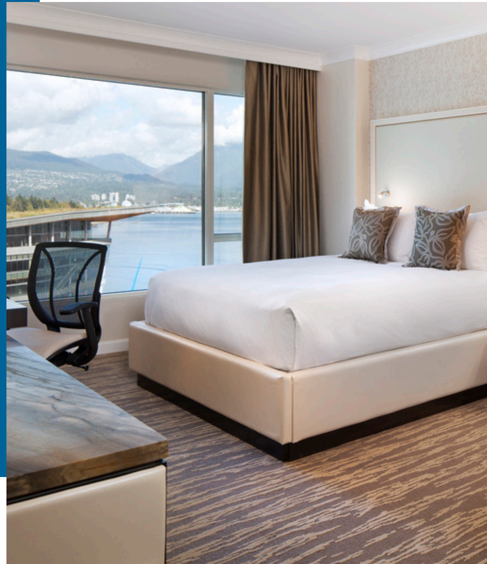
Fairmont Waterfront Vancouver