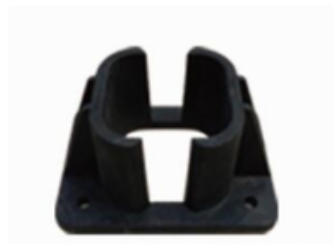
POST PLASTIC BASE