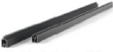
SPRAYED ALUMINUM RAIL W*H mm: 43*24/31 *24