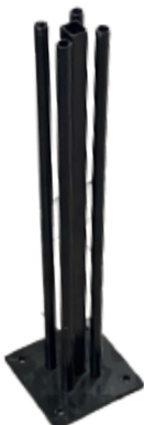
POST SURFACE MOUNT