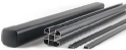
SPRAYED ALUMINUM POST W*H mm: 80*80